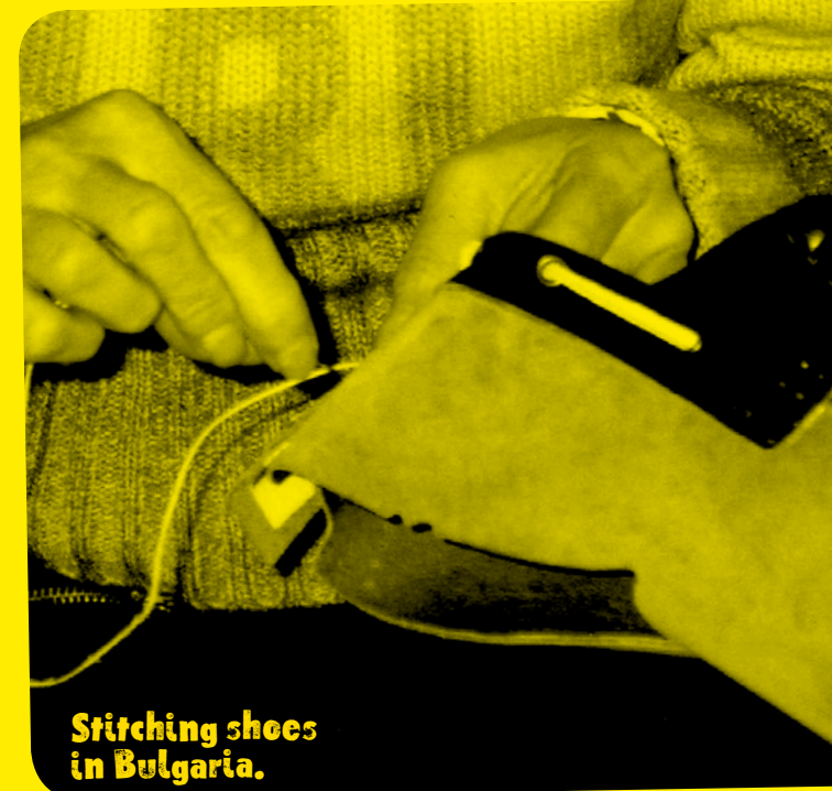
Stitching shoes in Bulgaria.

Decent work for homeworkers in the leather footwear industry.